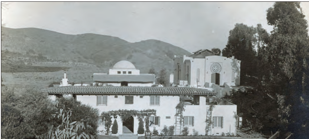
Krotona Court was located under the Hollywood sign in Beachwood Canyon. It was the first building established in Krotona Hollywood. Behind it to the right is the Temple of the Rosy Cross which was added later as a venue for masonic rites and large gatherings.