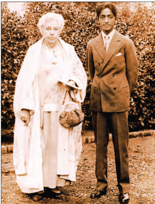
Annie Besant first visited Krotona with J. Krishnamurti. She had the vision that Ojai would become the birthplace of a more spiritually awakened humanity.