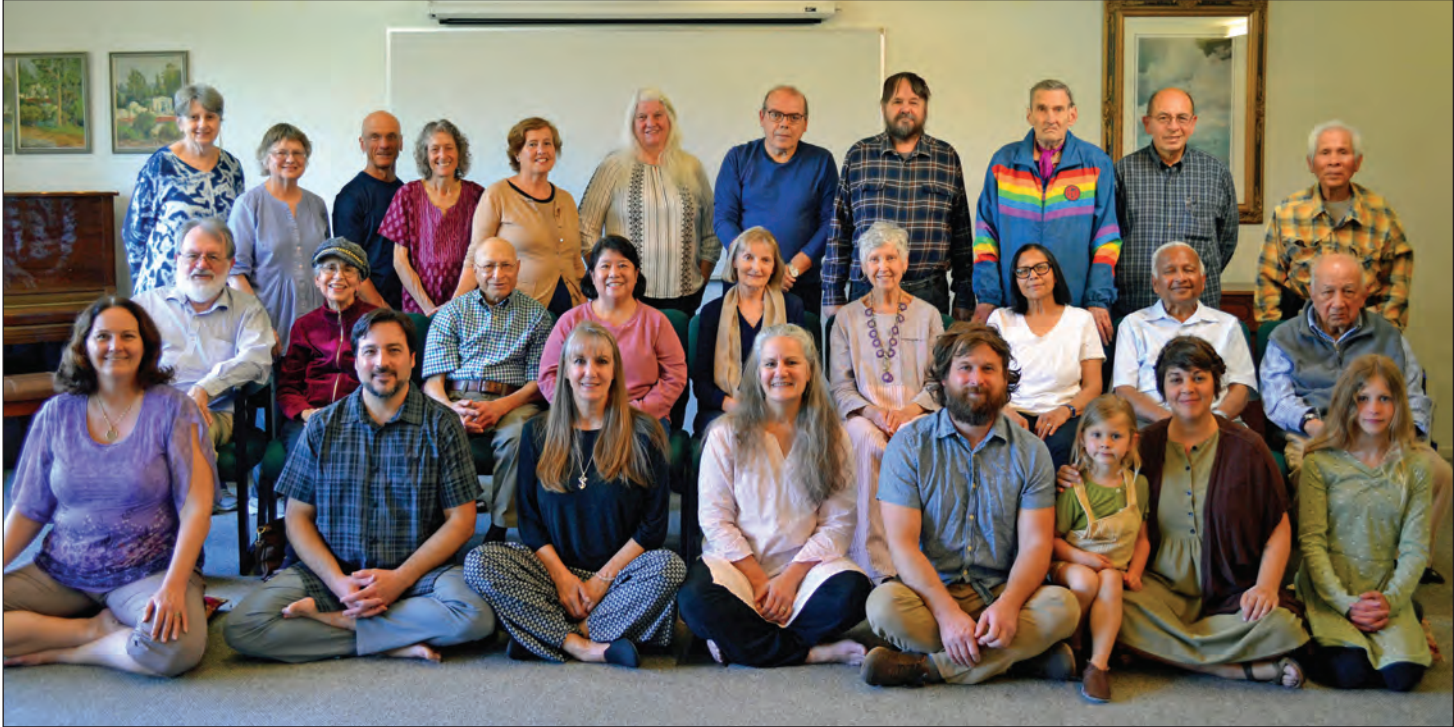
Krotona: 100 Years in Ojai