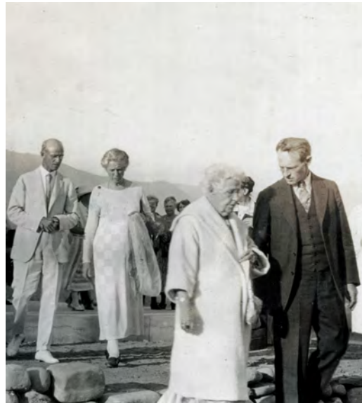
Annie Besant leaving the Krotona library veranda after giving her first talk in Ojai on her birthday, 1 October 1926.

To Besant, diversity is essential to life and our differences should not affect the feeling of kinship we must have with one another. She stressed that even a partial recognition of the truth of our interconnectedness would bring a tremendous change in the world. "Wars would cease. Mutual sympathy and help would replace criticism and condemnation. Selfishness would become the only sin," she stated. It is the solution to much human misery and her message is as true today as it was a century ago.