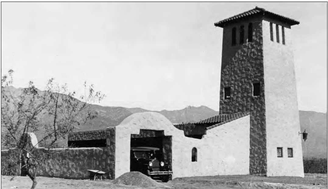
The Krotona Tower shortly after it was built in 1924. Once used as a water tower, it sits on the highest part of Krotona Hill in Ojai, in the heart of the upper residential loop.