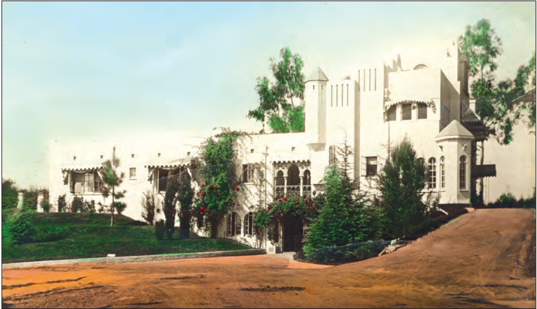
The Ternary consists of a series of three buildings. Built in 1915, it was just one of the magnificent structures in Krotona Hollywood incorporating Spanish and Moorish elements. It housed important members of the Krotona community.