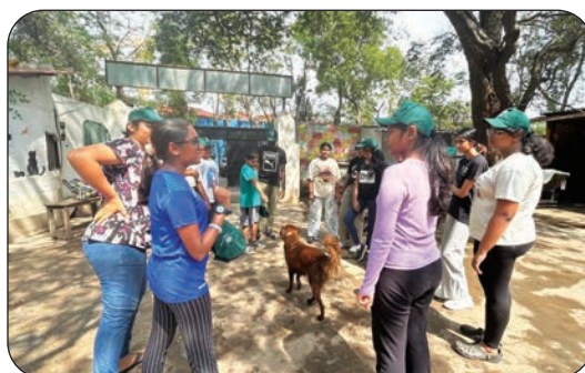
Learning about canines and their care