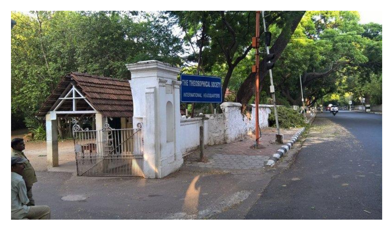
Besant Avenue Road, TS Gate on the left with blue sign

For your driver: International Theosophical Society Headquarters Chennai Alai Maram (big banyan tree) Besant Avenue Road Besant Nagar, Adyar, Chennai